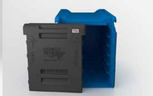
Removable door – even if the boxes are stacked