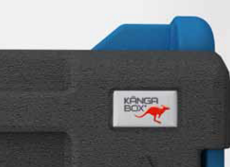
Innovative closure system – no odours