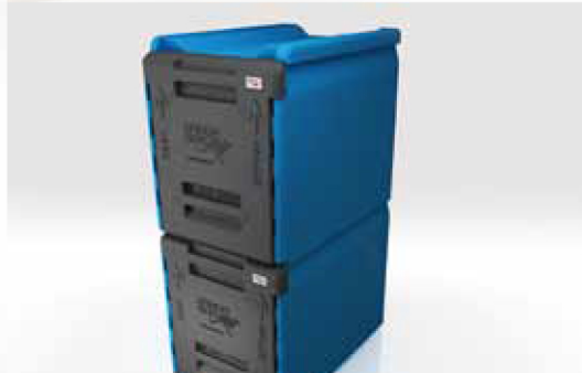
Stackable thanks to the secure locking feature