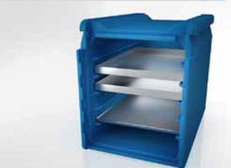
Five slide-in grooves for GN trays and GN containers