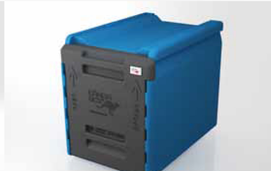
Sturdy and produced from one piece: for a long service life