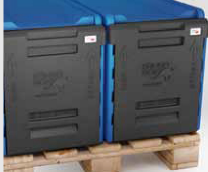
Fits perfectly on Euro pallets – four boxes per layer