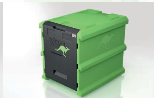
Manufactured in one piece for stability and a long service life