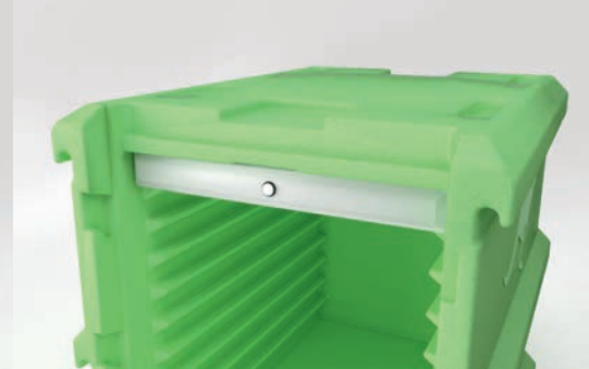
Insert groove for hot and cool packs