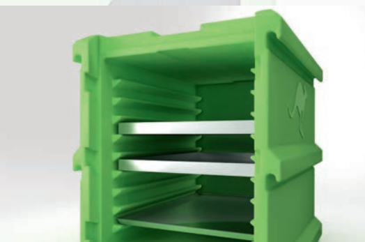
Choice of 6 or 10 insert grooves