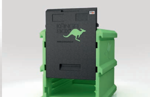
Removable sliding door for easy access