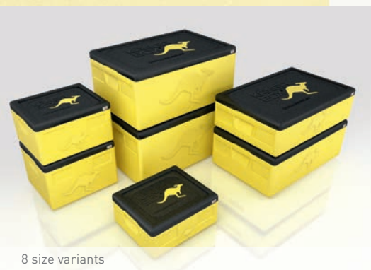
8 size variants