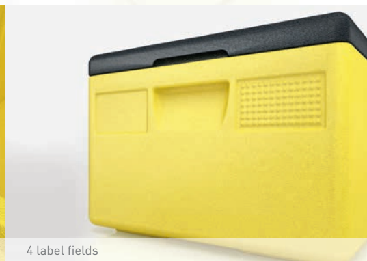
4 label fields