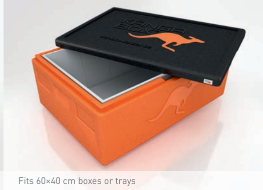
Fits 60x40 cm boxes or trays