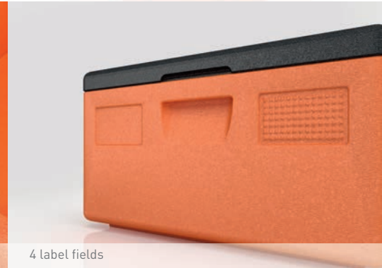
4 label fields