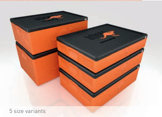
5 size variants