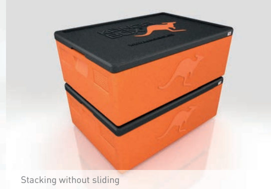
Stacking without sliding