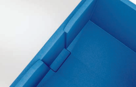
Recessed grooves for easy removal