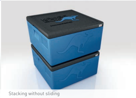
Stacking without sliding