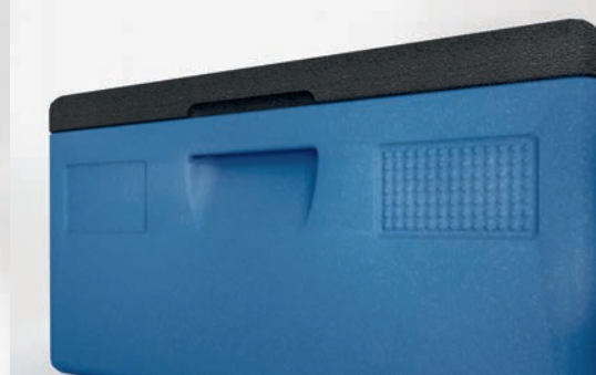
4 label fields