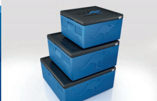
3 size variants